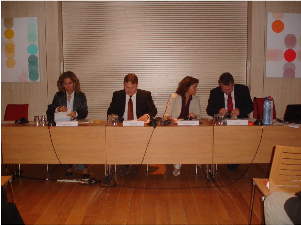
Workshop «Climate and demographic change»