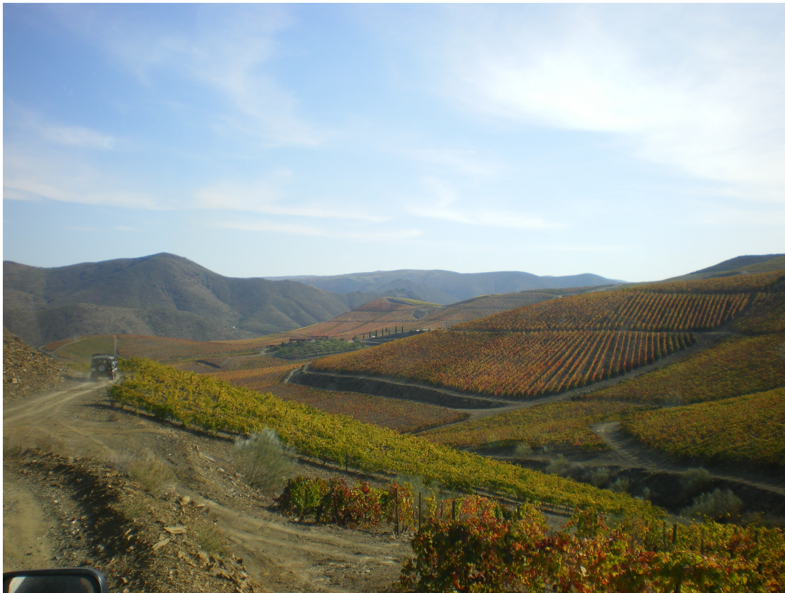
Picture 3: Trip to business initiatives in low-density areas: Enotourism in Quinta da Ervamoira