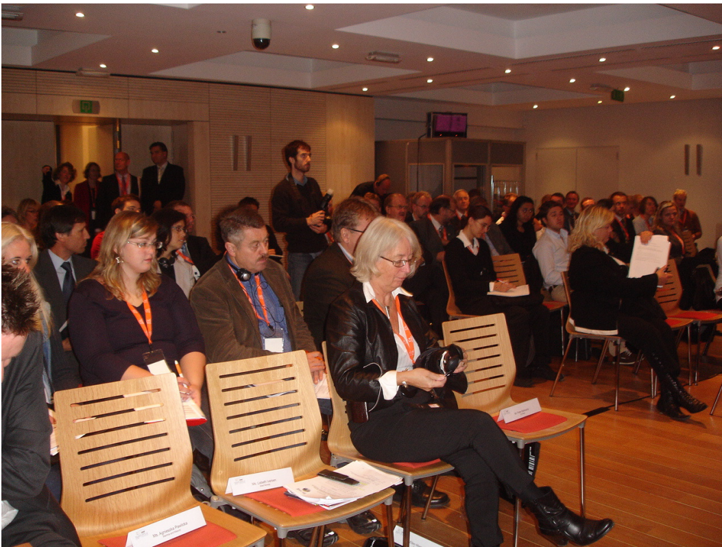
Workshop «Climate and demographic change»